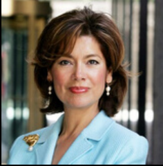
MARIA CONTRERAS-SWEET Former Administrator for the U.S. Small Business Administration